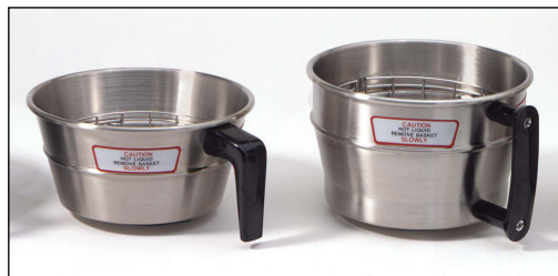
Standard and Large Gourmet Brew Cone for extra large throws.