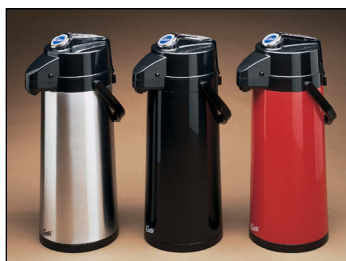
ThermoPro™ TLXA 2.2L Airpots. (Sold separately)

*ThermoPro Airpots NOT included. **Water Filtration Device Recommended.