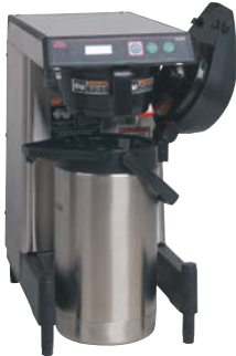
Model WAVE-APS with 2.5L lever-action Airpot (airpot sold separately)

Dimensions: 16.94-18.69" H x 9.71 W x 17.24"D (43cm H x 22.2cm W x 43.8cm D)