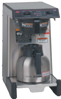
Model WAVE-S-APS with Deluxe 1.9L Thermal Carafe (thermal carafe sold separately)

Dimensions: 16.94-18.69" H x 9.71 W x 17.24"D (43cm H x 22.2cm W x 43.8cm D)